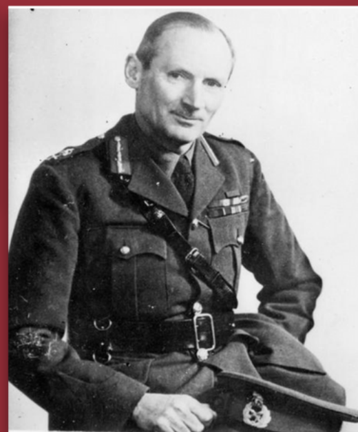
FM Bernard Montgomery

Fought from Oct. 23 to Nov. 11, 1942, the Second Battle of El Alamein resulted in a decisive German defeat by British forces in North Africa during World War II. Church bells were rung in England for the first time since the war had started. The victory was achieved by then Lt. Gen. Bernard Law Montgomery, a son of the Royal Warwickshire Regiment and First World War combat veteran, who rallied the spirits of British troops and used his analytical genius to exploit German strategic weaknesses. "Monty" would go on to organise and lead all Allied land forces - a total of 2 million men - in battle on D-Day in 1944. In addition to his unparalleled military accomplishments, Monty lived a life of service, undertaking many charitable initiatives even during the war, and was a gifted and prolific author of military history and studies on leadership.